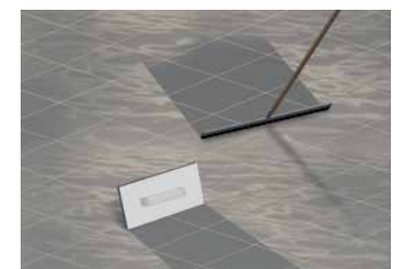
6 Slide diagonally across excess joint mortar