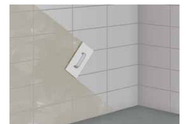
Note: The adjacent floor jointing process is also valid for wall areas