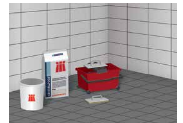
2 CRISTALLFUGE-HF, suitable tools