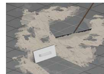
5 Apply the joint mortar