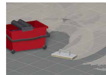
7 Emulsify the joint mortar after setting