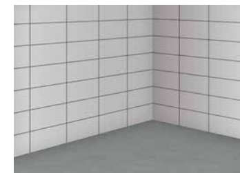
1 Available floor surface, bonding bed is set