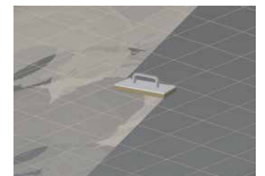
8 Rinsing off surfaces diagonally to the joint direction