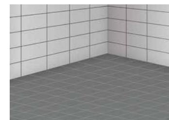
9 Finished and jointed floor surface