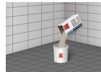
3 Fill the joint mortar into a clean mixing bucket