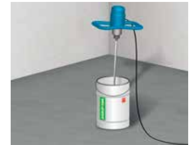
6 Mixing, decanting and mixing again into the resin