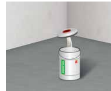
5 Completely emptying the hardener into the resin