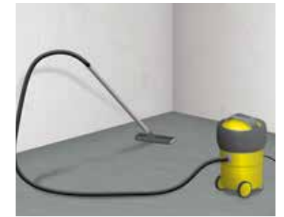
2 Cleaning the floor substrate