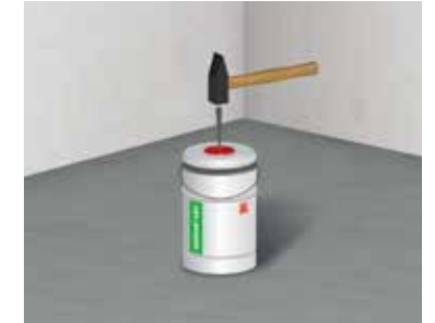
4 Puncture the lid of the hardener component