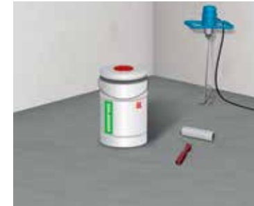
3 Priming and suitable tools