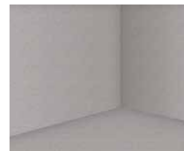
9 Completed floor