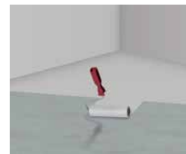
7 Application of the primer on the floor