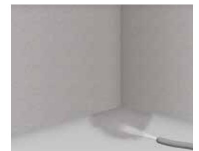
8 Fully broadcast the fresh primer with quartz sand