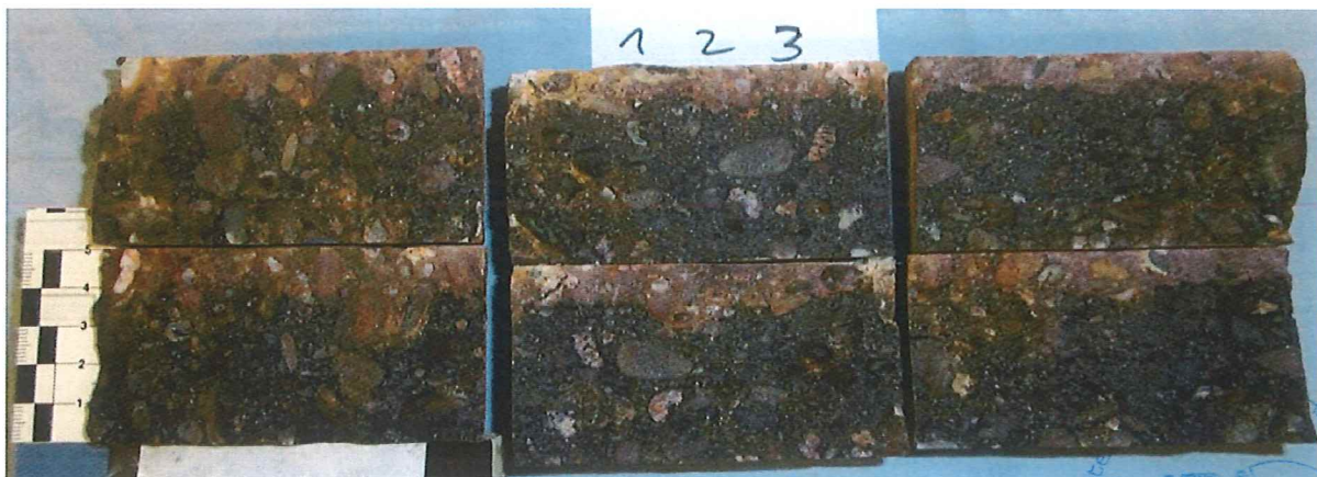
Appendix A1-2: Samples after testing, reference